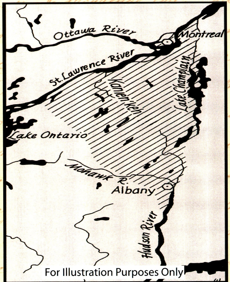
Kanienkeh Territory Map from Historic Kahnawake Series #6 Kanien'keháka Onkwawén:na Raotitiohkwa Cultural Center

After European contact, the Kanien'keháka formed alliances and signed peace and trade treaties with the Dutch, English and the French based on the Two Row Wampum principles of respect, sharing, partnership and peaceful co-existence.